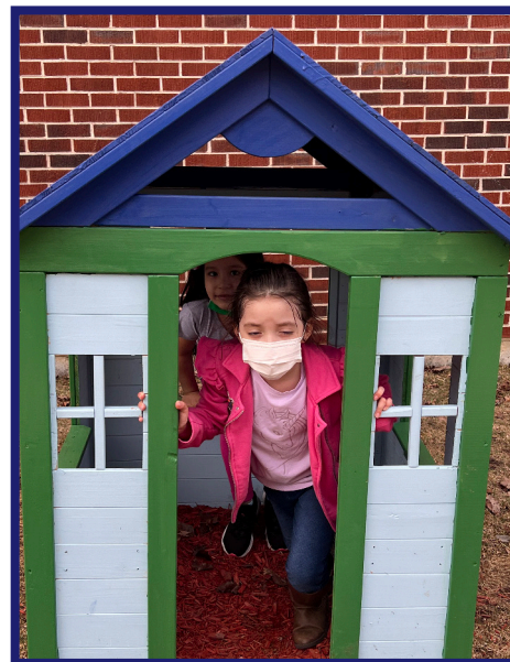
Kindergarteners in new playhouse